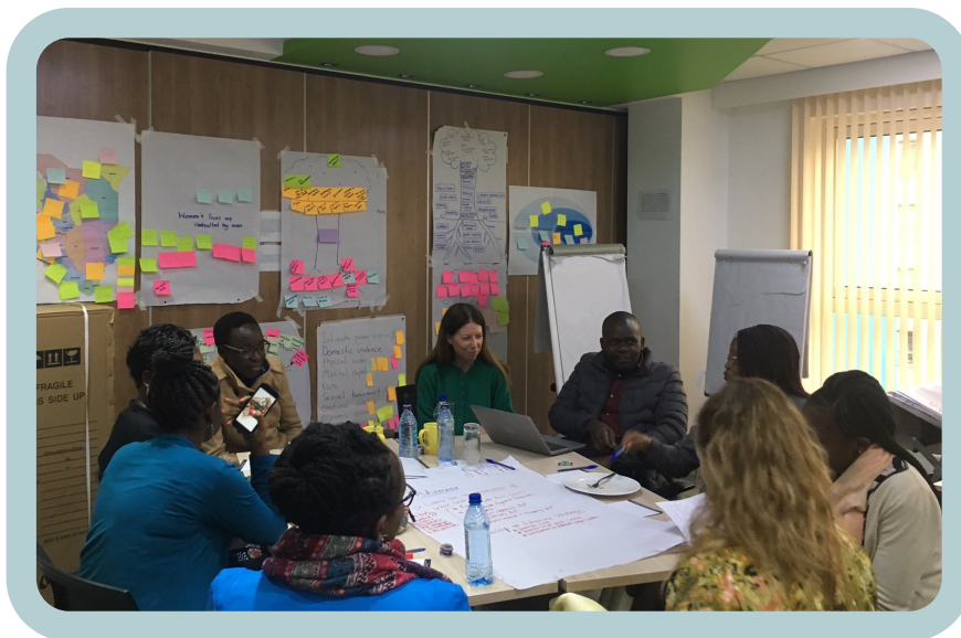
Participants of the Joint Learning Trip in Nairobi (September 2019)