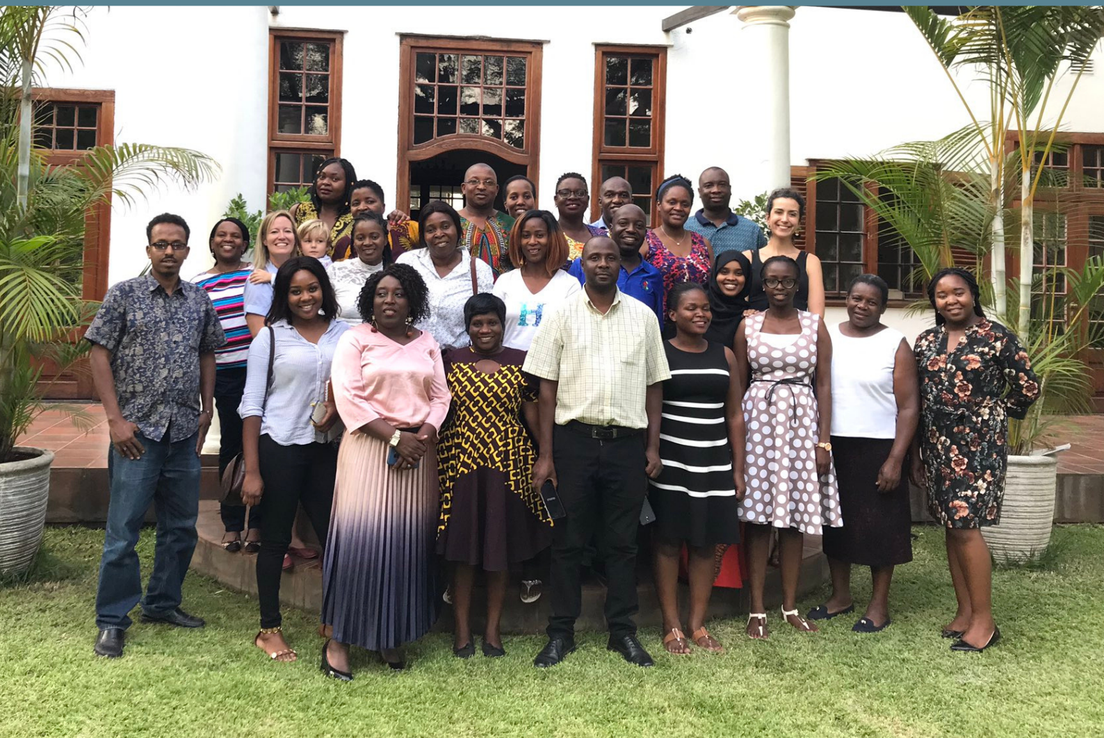
Participants and trainers in the IASC Training in Zimbabwe (November 2019)