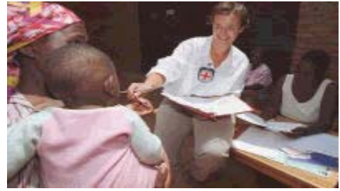
ICRC/Rwanda (Ref. : n° 00183)

Detained minors must be protected by particular measures. Apart from very young children who accompany their mother held in detention, minors must be separated from adults, receive special care and be dealt with by an adequate judicial system. When visiting detainees, the ICRC carefully checks whether the rights of minors are being respected by the authorities.