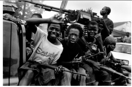
ICRC/Liberia (Ref. LR-E-00067)

particular the other members of the Red Cross and Red Crescent Movement – in practical steps to help them find their way again in society.