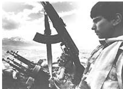
Child soldier in Afghanistan

With regard to young people at risk of becoming involved in an armed conflict, the emphasis must be on discouraging them from joining an armed group. To date, the ICRC has only occasionally been able to do anything specific to this end. Regarding child soldiers, the organization must try to ensure that it is perceived as unthreatening and impartial, and that the Red Cross emblem is respected, i.e. that the safety of ICRC personnel is assured. The objectives of communication activities for child soldiers are: