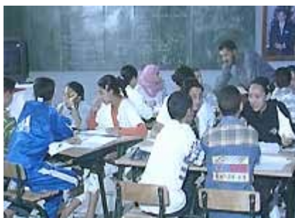
EHL pilot phase, Morocco