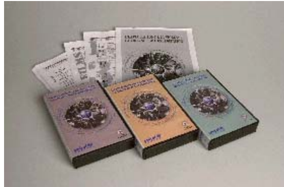
Teaching module "Exploitation of Violence"