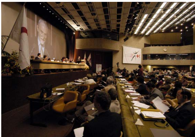
Opening of the first plenary session of the 28th International Conference of the Red Cross and Red Crescent (3 December 2003)

Action 11. States will seek to improve the plight of children living in difficult circumstances by meeting their special needs, with emphasis on prevention of sexual exploitation and physical and other forms of abuse and the sale of children with the ultimate objective of the reintegration of these children into their families and society. States will strive to achieve the rapid conclusion of the work of the United Nations Working Group on an Optional Protocol to the Convention on the Rights of the Child, on the Sale of Children, Child Prostitution and Child Pornography.